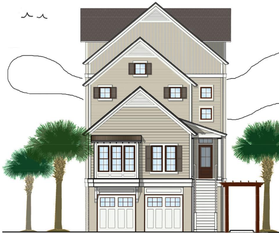
SEAVIEW LOOP ELEVATION